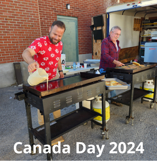
Canada Day 2024