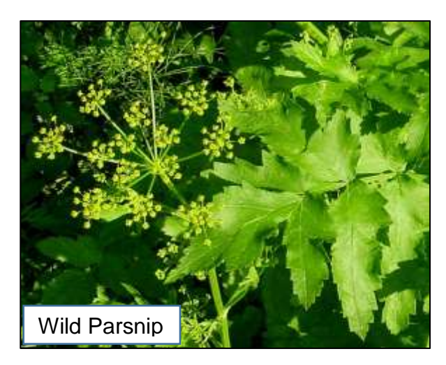
(WiseAcre Gardens, 2015)

The leaves of Wild Parsnip are heavily toothed and can have a distinct mitten shape. The plant has 5 to 7 leaflets per leaf that form a diamond shape leaflet structure. The plant produces clusters of individual small bright yellow flowers, 10 to 20cm in diameter. Wild parsnip can grow to a height of 50 to 150cm.